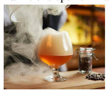
Bar 190 is open till 1 am from Monday to Saturday and till 10.30pm on Sunday.

A menu of small plates is served, from glazed lamb ribs with chimi-churri and yogurt to steak haché with toasted sourdough, gherkins and chutney, all available for pairing with the preferred cocktail.